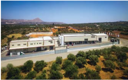
Central facilities – Factory in Chania – Crete- Greece