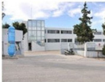
Warehouse in Heraklion - Crete