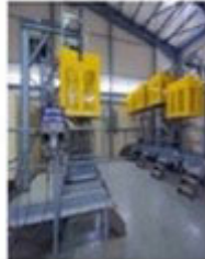
Gas Bottling Unit