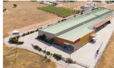
Warehouse in Athens - Greece