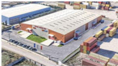
Warehouse in Thessaloniki - Greece