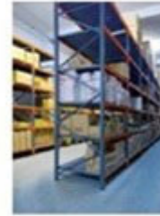
Warehouse in Crete