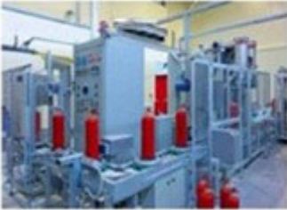
Automatic Production Line